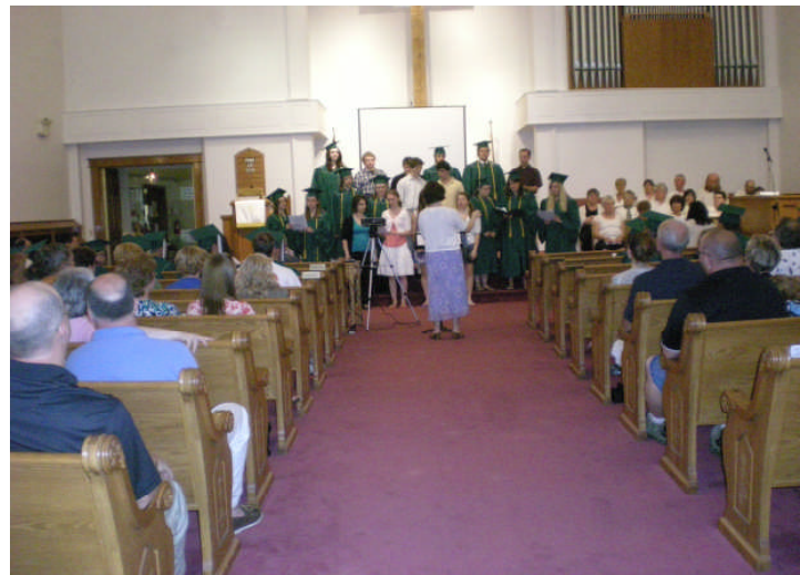
Greene Central School Select Ensemble.