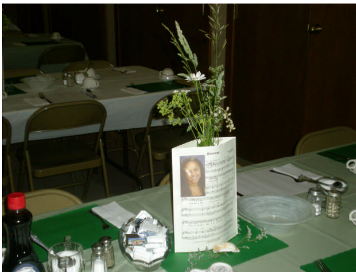
Tables set up for the Elissa Case benefit breakfast on June 18.