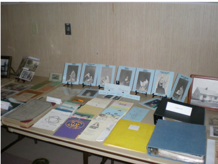
Women's Fellowship display showing "Living Madonnas."