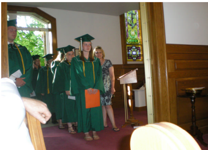
Graduates wait to enter for baccalaureate services.