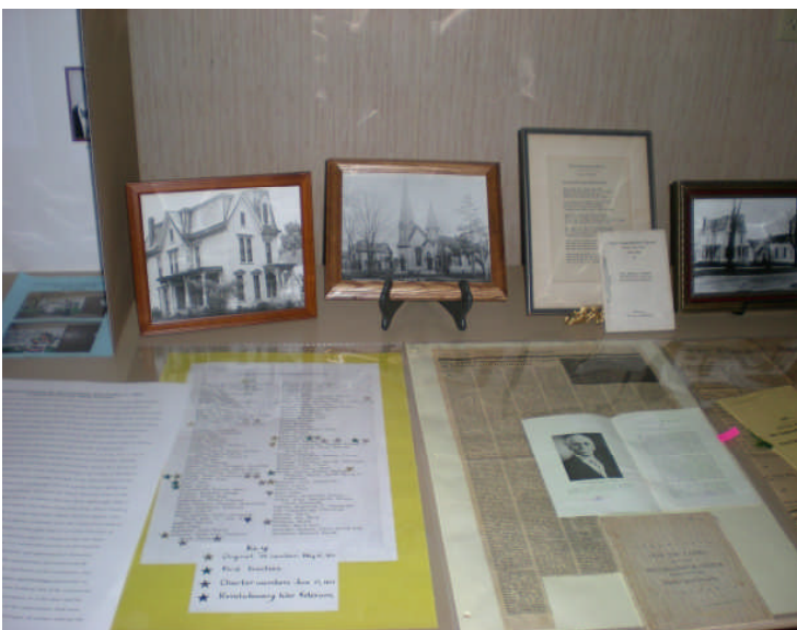
Centennial year celebration showing pictures of the old manse and the church after it was remodeled in 1871-1873.